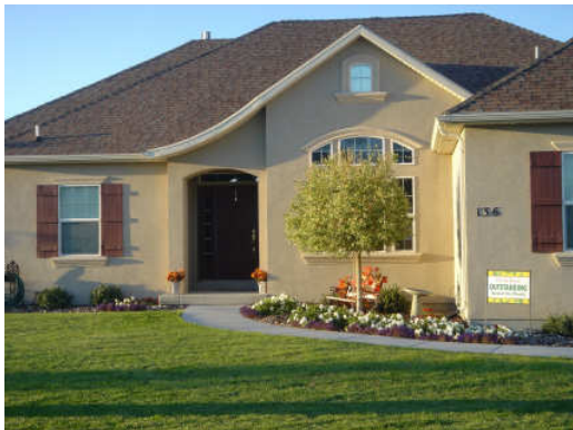
136 Battalion Bay