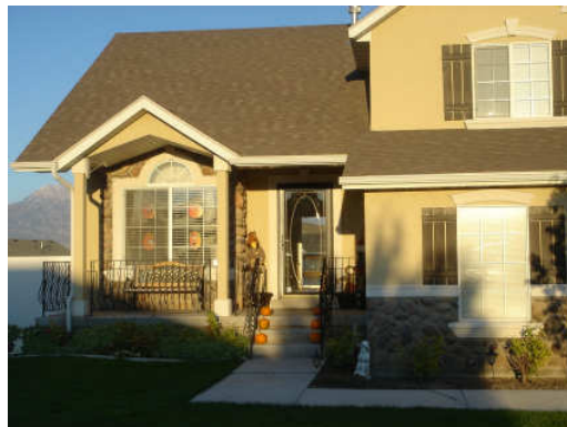
1241 Wagoneer Rd